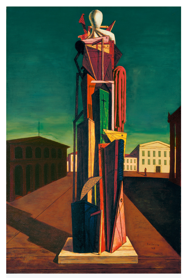
"Il Grande Metafisico," ("The Grand Metaphysician"), 1917 by Greek-Italian artist de Chirico.