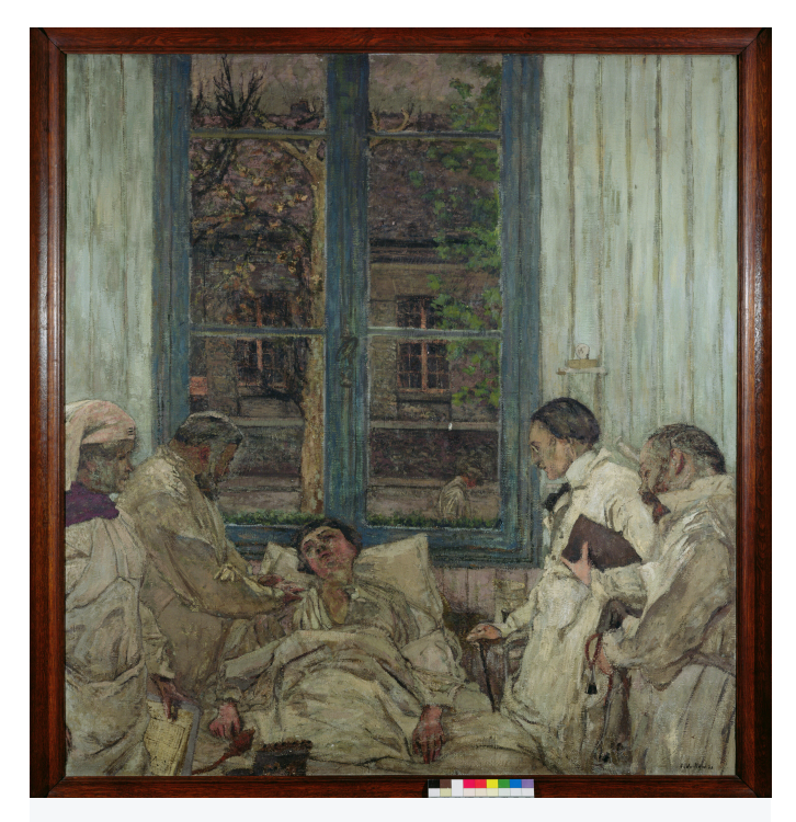
The Doctor Henri Vaquez by French artist Edouard Vuillard, early 20th century.